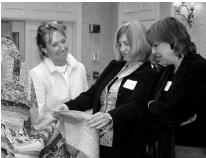
Luncheon guests admiring Handmade Quilt at the 2004 Silent Auction.

A silent auction will be held again in conjunction with the KidSafe Annual Awards and Luncheon.